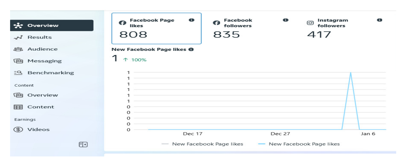
Chart 1: Number of Audiences through GCCTC Social Media Accounts.

The media awareness campaign, a pivotal component of the Gender Mainstreaming in Climate Change Strategies in Tanzania Project, funded by the Gender Responsive in Policy and Practice (GRRIPP) initiative and meticulously executed by the Gender and Climate Change Tanzania Coalition (GCCTC), transpired on the 21st of December in the Tanga and Mwanza regions of Tanzania mainland. This strategically designed initiative aimed at fostering awareness and understanding of identified policies was successfully executed across multiple platforms, resonating with an extensive audience of over 1252 Tanzanians. The efficacy of the campaign is underscored by the diverse array of platforms employed, as depicted in the accompanying chart, which meticulously outlines the distribution of the audience across various communication channels during the course of the campaign.